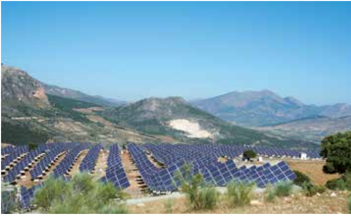
KPV ground mounted PV park / Spain

KPV – your ideal partner for Photovoltaic Power Plant Projects.