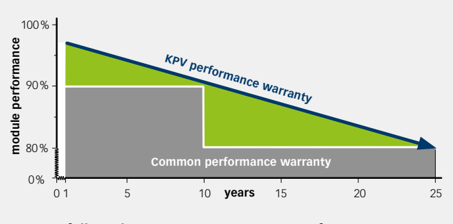
12 years full product warranty + 25 years performance warranty